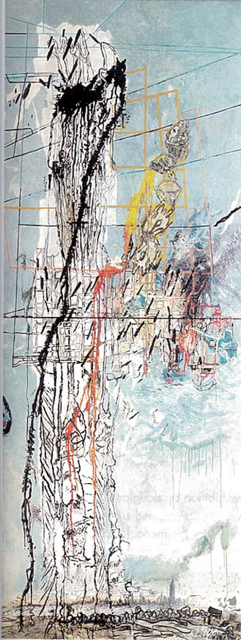
left: Susanna Heller, Ghost Tower , 2003, oil and rice paper on canvas and linen, 72 x 57" each, 144 x 57" overall.