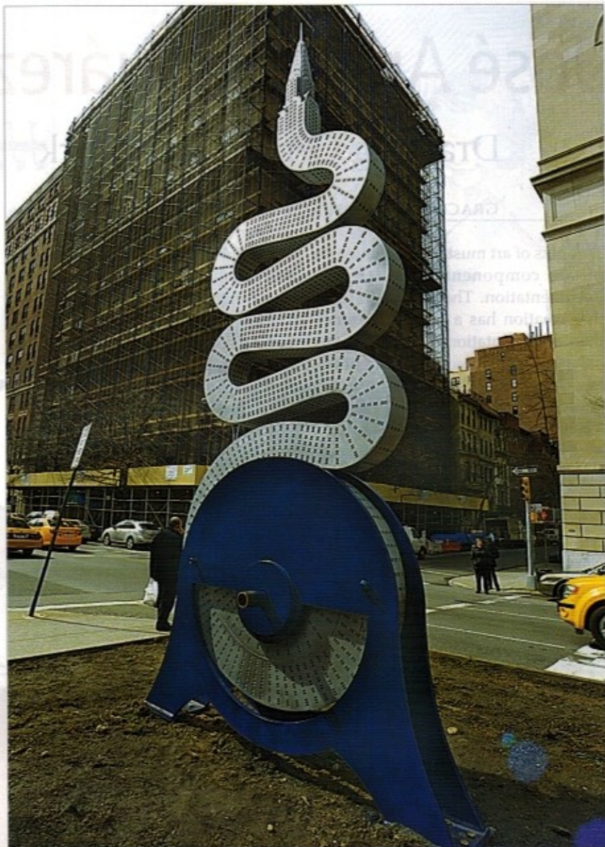
Chrysler (No Limits) , 2013. Steel. 14 1/2 x 6 1/2 x 8 ft. (425 x 194 x 272 cm.).

In addition to the Park Avenue works, Magnan Metz Gallery is exhibiting a fuller realization of Arrechea's vision. Included in the gallery exhibition are dozens of smaller-scaled sculptures done in the same subjects as the larger works. Although these are referred to as "maquettes" not all of them were translated into larger versions and all of them can stand independently on their own. In these works the smaller scale allows for a slightly expansive use of materials and sense of playfulness of form—they all seem more toy-like at this size—and of course there is a new sense of the unfamiliar to all viewers when engaging these giant icons rendered