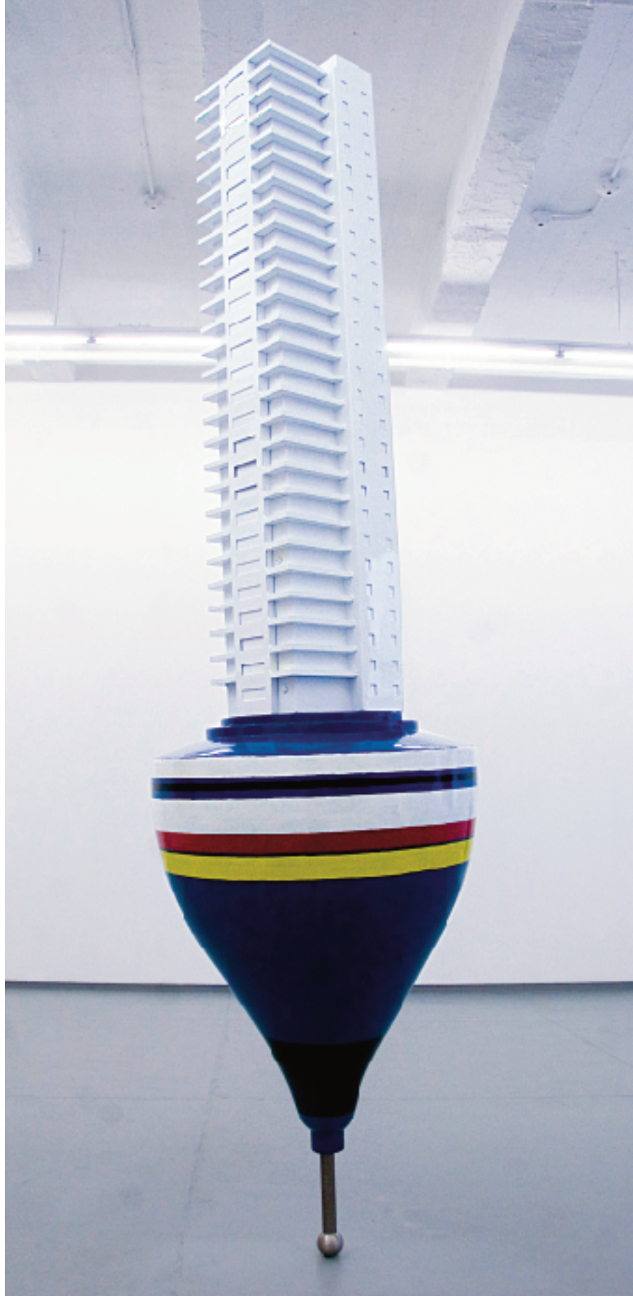
Someillan, 2010. Aluminum, wood, and resin, 84 x 43 in.

AA: The tallest sculpture is the Courthouse. This is meaningful to me because it's the law first and then the rest. It was also the first of the 10 to be installed.