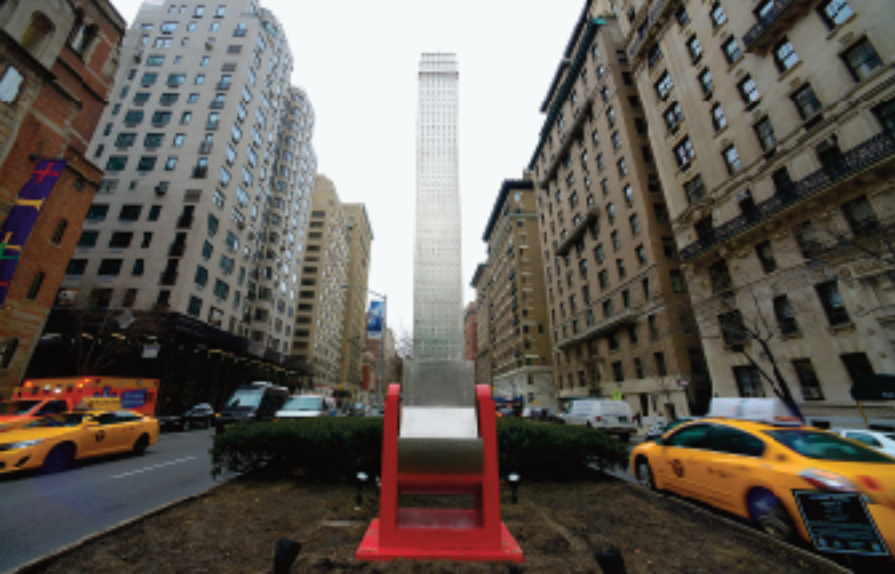
Left: Courthouse , 2013. Aluminum and steel, 20 x 4.3 x 3 ft. Center left: Helmsley , 2013. Steel, 15 x 14.5 x 2.6 ft. Bottom left: Citigroup , 2013. Foam, polyurethane, and steel, 16.5 x 6 x 2 ft.

It resembled a sort of traffic barrier closing the entrance at Park and 60th Street. It leans to the right to show that law and order can collapse.